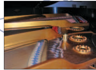
Mason & Hamlin Model A

Mason & Hamlin Model A from 1914 offers a pure classic design in a satin ebony finish. Made in Boston during the "golden era of piano making," everyone will be drawn to this dynamite instrument and anyone who plays it will wish to own it.