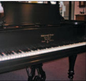
Steinway Model A

Two newly restored pianos receive A+ ratings from Farley's!